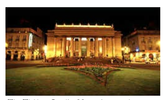
The Théâtre Graslin, Nantes's opera house

You will participate in excursions and various cultural events. Some of these activities will be offered and organized in fall semester by the UW on-site coordinator who will stay in Nantes for the first week of the program. A two-person team of local coordinators will be available for assistance and conversation classes throughout the semester.