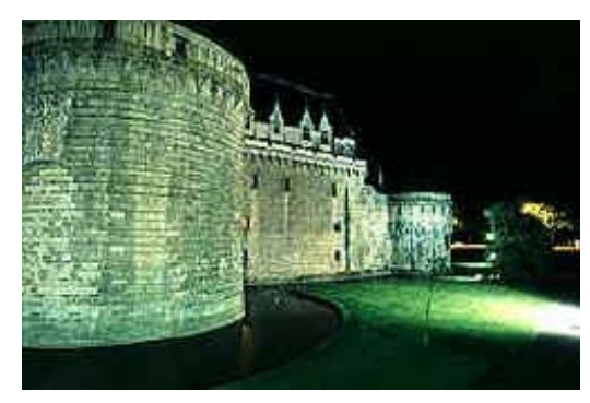
Castle of the Ducs of Bretagne in Nantes

You may be asked to take a placement test to determine which UW French level you are eligible for upon your return from the Nantes program.